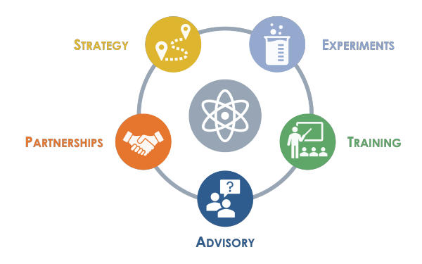
Fig. 2: QCC Objectives.