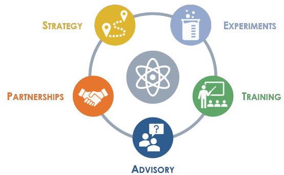
Fig. 2: QCC Objectives.