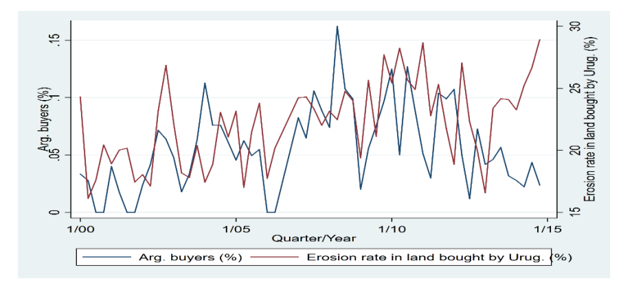
Percentage of Argentinian buyers and Mean erosion rate in land bought by Uruguayans